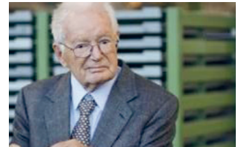
Promotion of dual-track education Hans Huber Foundation