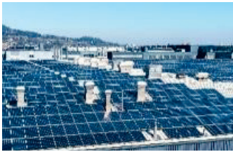
Renewable energy Purchase and own production