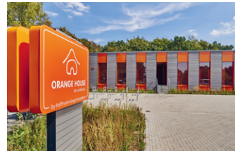
Social engagement Hoffmann Group Foundation supports disadvantaged children