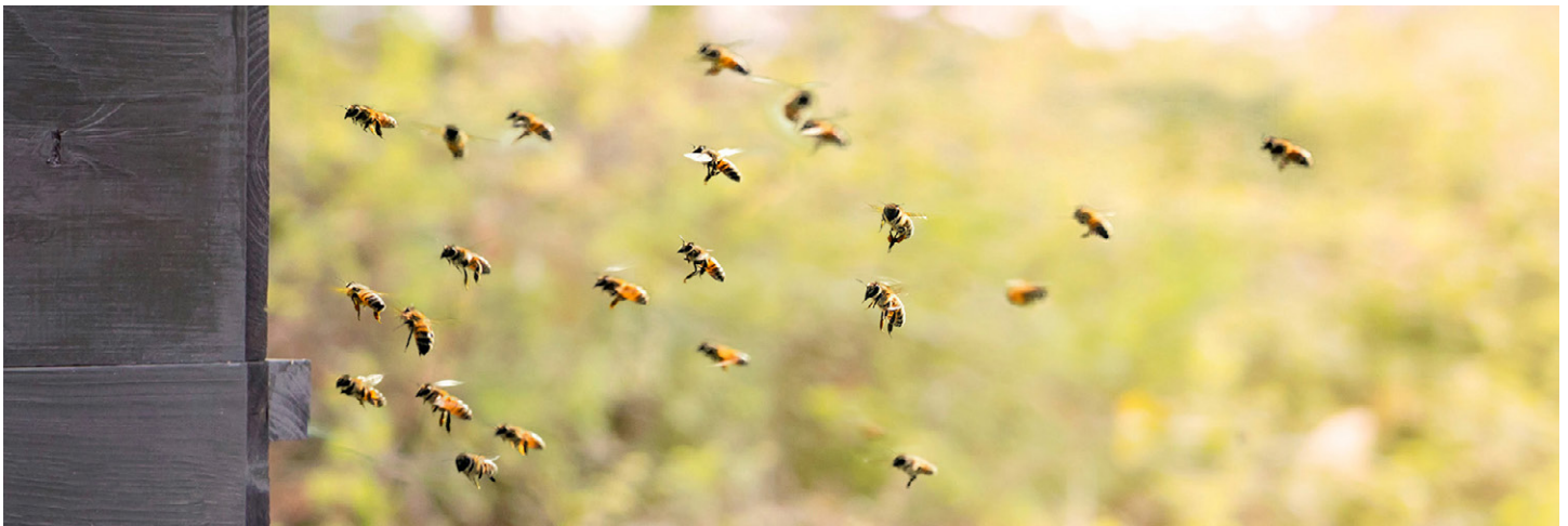
The site in Oberursel (Germany) has established a bee colony on its premises as a biodiversity project.

In our business activities, we attach great importance to protecting and preserving biodiversity.