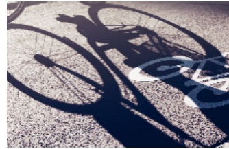
Mobility and transport Sales, Logistics, Employees