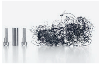
Lean & Green program Efficient production, waste reduction