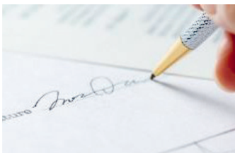
Compliance Fair Competition, Anti-Corruption