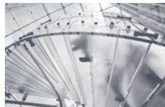
Transparency Transparent and accurate reporting