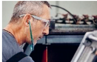
Occupational health and safety Minimize work-related accidents