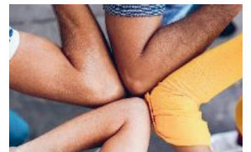
Diversity Promoting the value of diversity