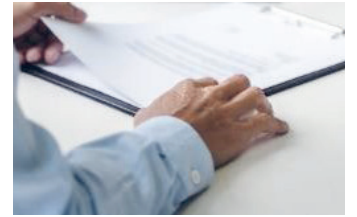
Sustainable value chain Supplier assessments