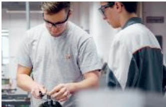
Training and education Vocational training, lifelong learning

generate added value for all stakeholder groups