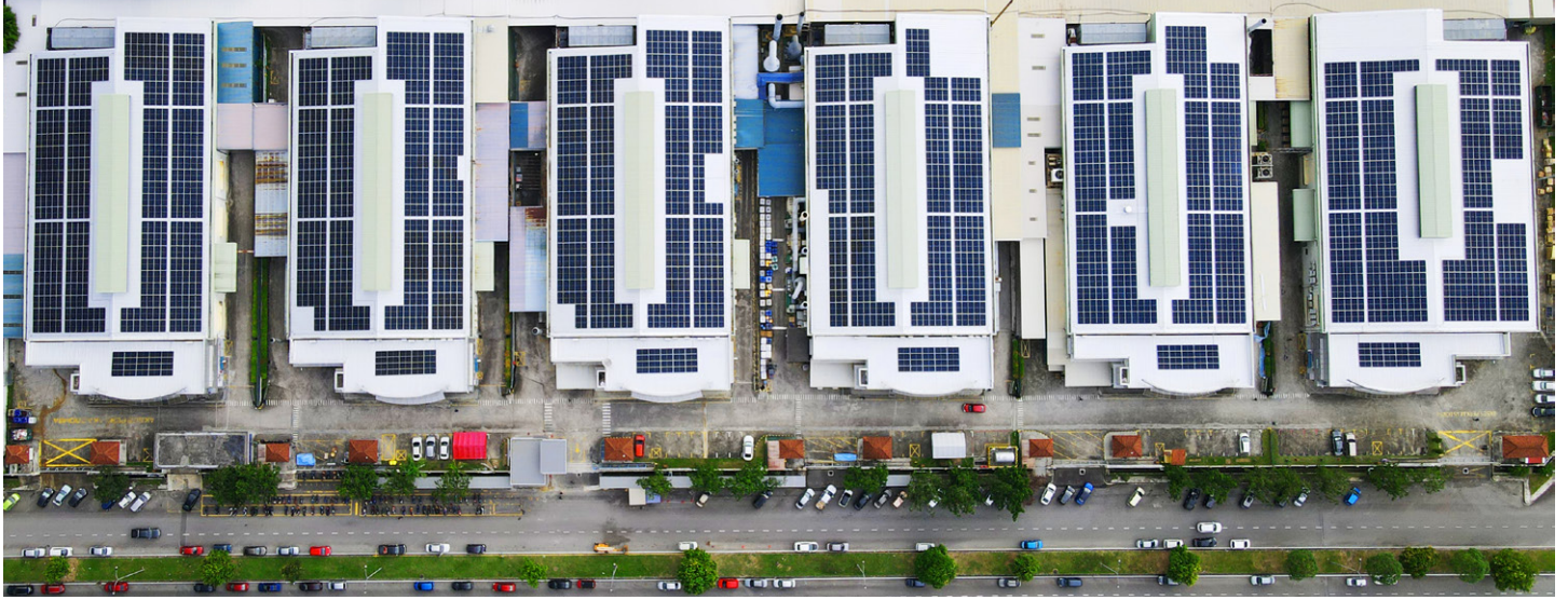
The new photovoltaic system in Malaysia produces 1,720 MWh of renewable electricity per year.